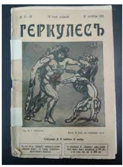
Figure 3. Image of Hercules wrestling the Hydra.

In addition to these men's fitness magazines, the illustrations in detective novels, which are built 'always and invariably [on] a double reading of the evidence' (Eisenstein 1995: 601), provided another rich source of homoerotic imagery for children of Eisenstein's generation. As Eisenstein notes, illustrations in Pinkerton detective novels often featured 'streams of sweat and torn shirts' (Eisenstein 1995: 401). It is therefore notable that Eisenstein attributes his first wet dream to a Nick Carter detective story (Eisenstein 1995: 542). In a later chapter, his interest in the 'inversion of opposites' extends to cross-dressing balls and bisexuality 'when it enters clearly